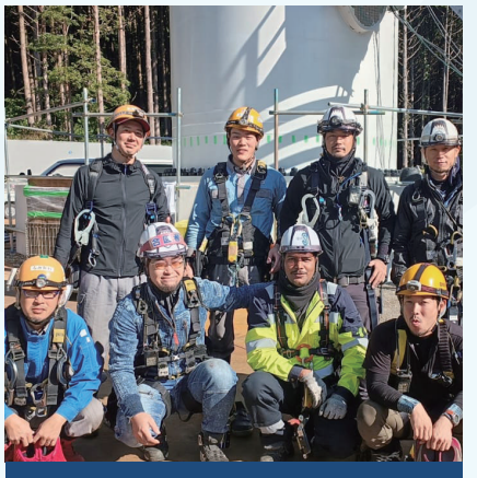
Japan Branch in Tokyo