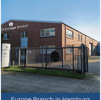
Europe Branch in Hamburg